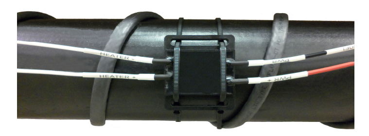
SoliStat 2 in a 12VDC heat tracing application (insulation removed).

All SoliStat models utilize semiconductor output switches that are heavily protected against ESD. In addition, the outputs will withstand the counter-EMF generated at switch-off by many inductive loads. Because of this SoliStat will outlast any relay or contactor that may have been considered for your application.