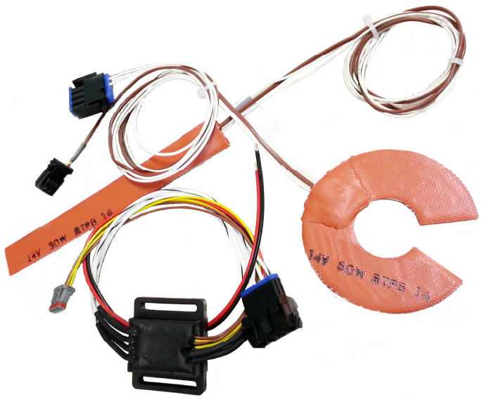
SoliStat 2XD-10 with heaters for a CCV filter warming application